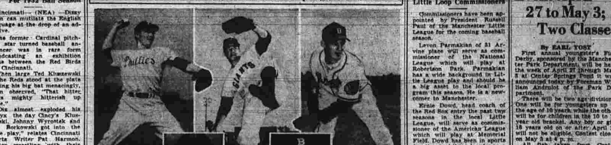
Young anglers showed how for the fish, with one boy catching a bluegill. The derby was held at Center Springs and was a success.