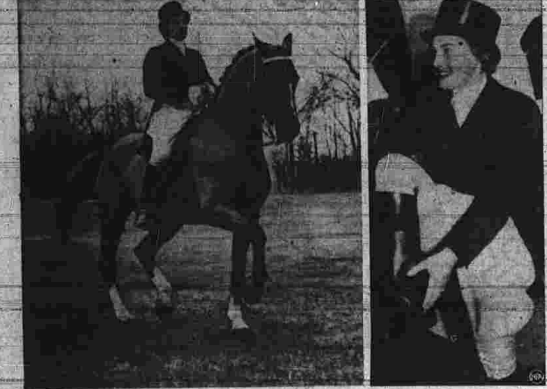
Marchers advance a step before boarding her float. The Flying Dutchman, for a special Olympic Games workout at Scarborough, N. Y., the year-old Guyver Valley, Pa., dressed as the only girl on the United States Olympic Equestrian team, will be one of three American equestrian riders competing at Helsinki this summer.